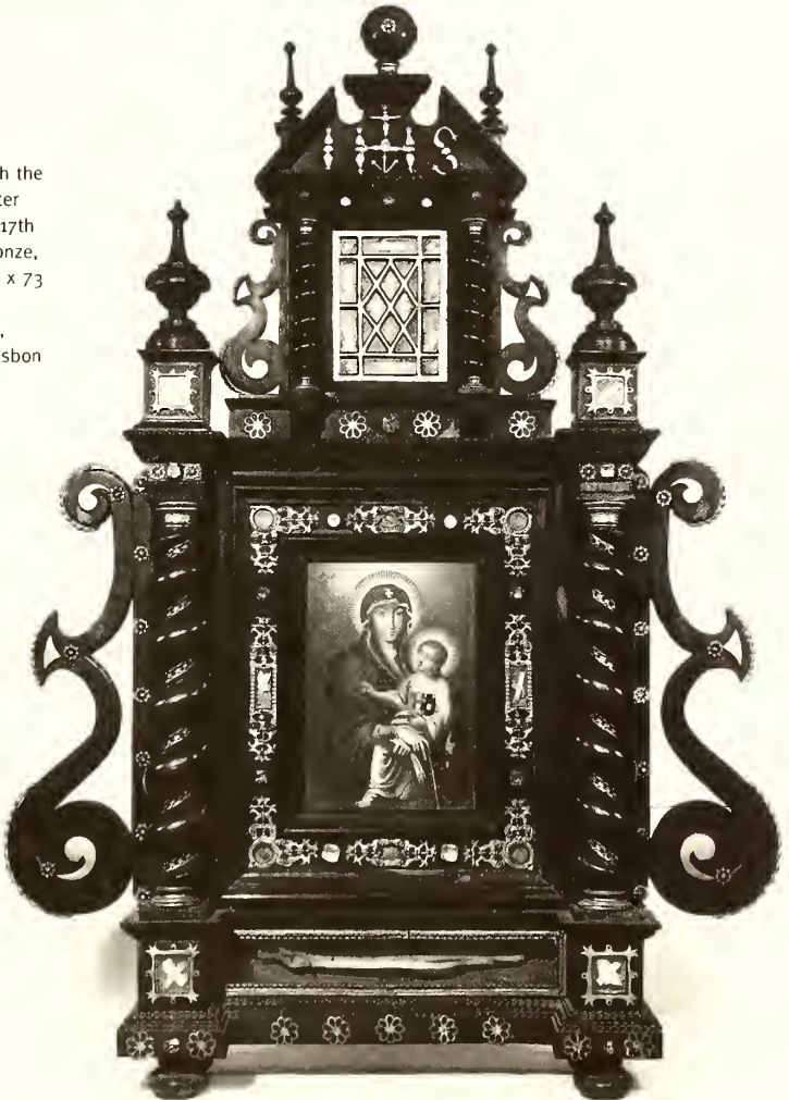
Figure 8. Reliquary with the Madonna and Child after St. Luke. Portugal, 16–17th century. Ebony, gilt bronze, and painted glass, 101 x 73 x 17. Santa Casa da Misericórdia de Lisboa, Museu de S. Roque, Lisbon